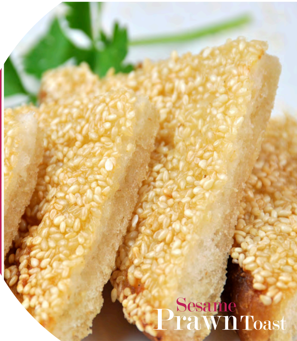
Sesame Prawn Toast