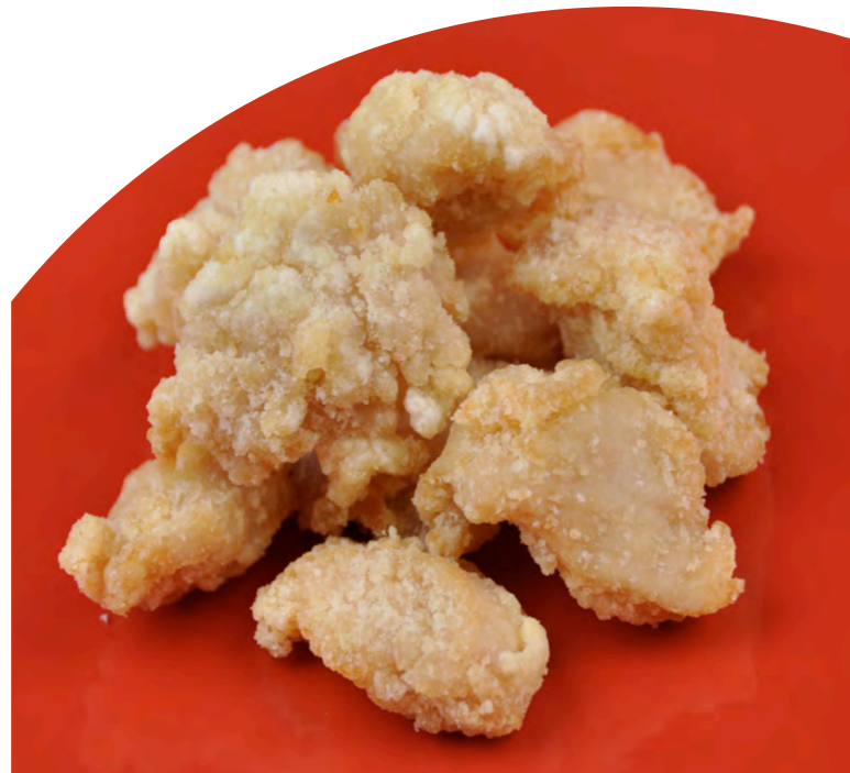
Battered Pork Hong Kong Style