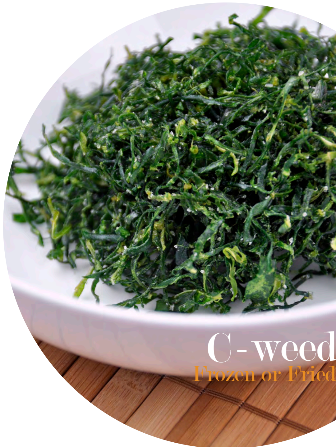
C-weed Frozen or Fried